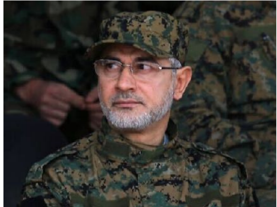
Senior Hezbollah leader Ibrahim Aqil, Deputy Commander of Hezbollah's Armed Forces.