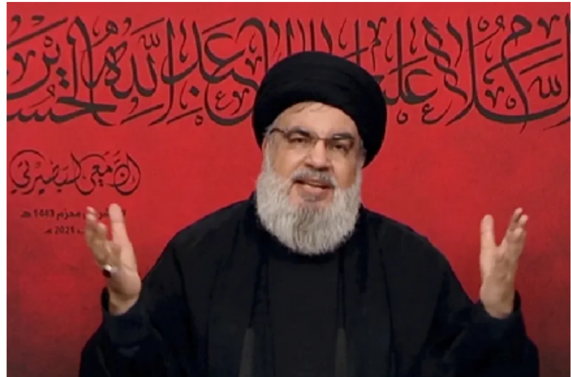
Hassan Nasrallah, General Secretary of Hezbollah prior to his death.

White House: "Hassan Nasrallah and the terrorist group he led, Hezbollah, were responsible for killing hundreds of Americans"